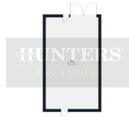
Ground Floor Building 3